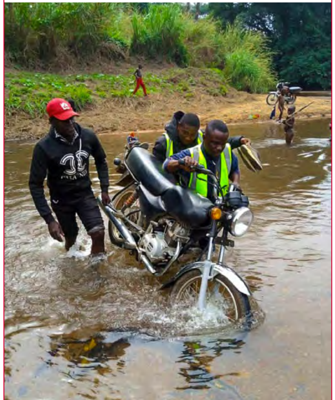
Accessing Ngada Communities in Nigeria

With funding from CFCS, the Janna Health Foundation launched a TB project in the communities of Ngada and neighbouring LGAs and conducted their first visit in December 2020 to support Health Care Workers and Community Volunteers. In the process, two laboratory technicians were identified, a microscope was provided by the Taraba State TB Control, and the leader of the Development Area Council donated room space, an electricity generator and a motorcycle to support TB screening and sputum transportation. At the time of the end of the visit, four new cases of TB had been detected from two community outreach sessions.